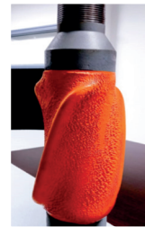
ESP equipment centralizer